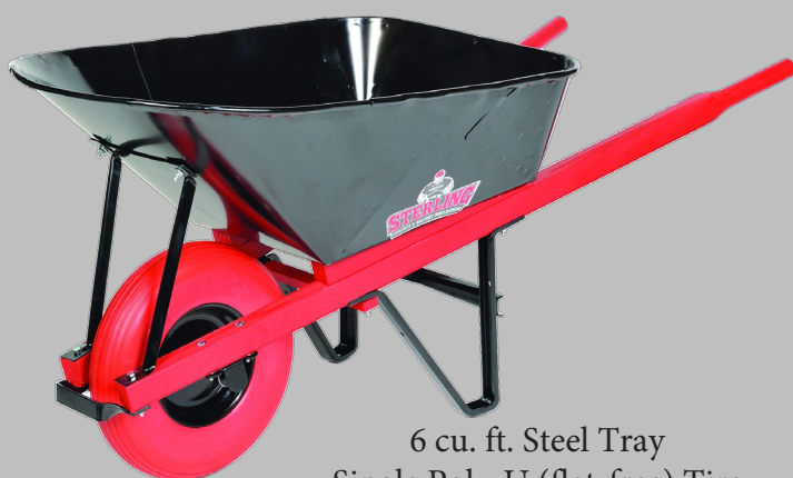
6 cu. ft. Steel Tray Single Poly-U (flat-free) Tire