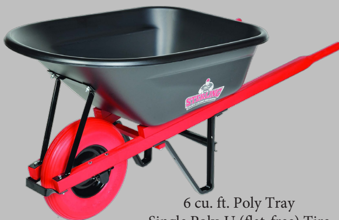
6 cu. ft. Poly Tray Single Poly-U (flat-free) Tire