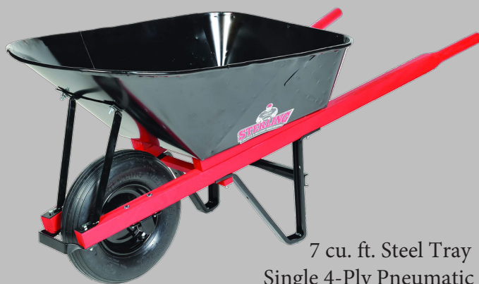
7 cu. ft. Steel Tray Single 4-Ply Pneumatic Tire