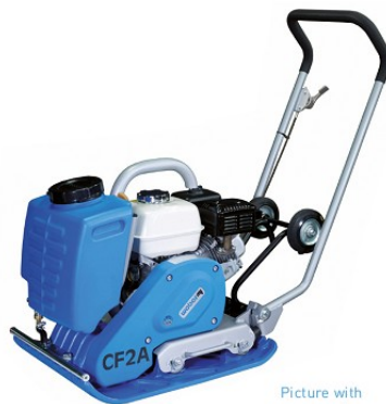
Picture with accessories