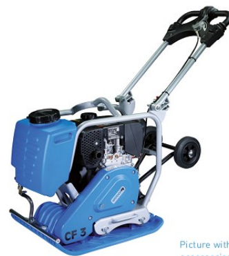
Picture with accessories