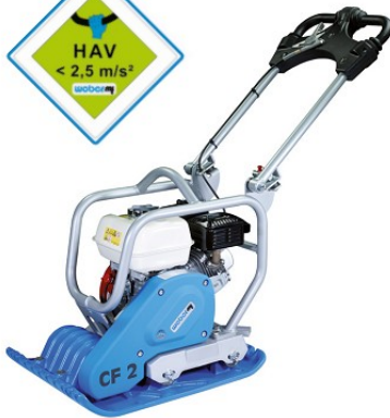
CF 2 Hd