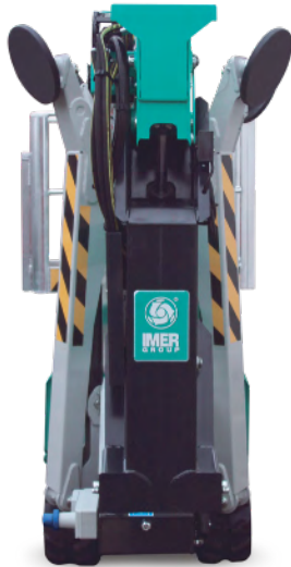
Compact width allows access in narrow, hard to reach places