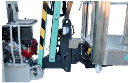
Compact jib assembly hosting both the load sensor and basket rotation system.