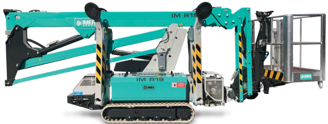
Easy access both outdoor and indoor. Non-marking tracks for indoor use