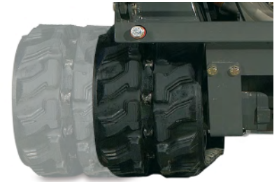
Hydraulically adjust the track width for added stability and traction.